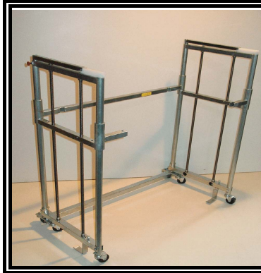
36" Wide Lifting AllDolly